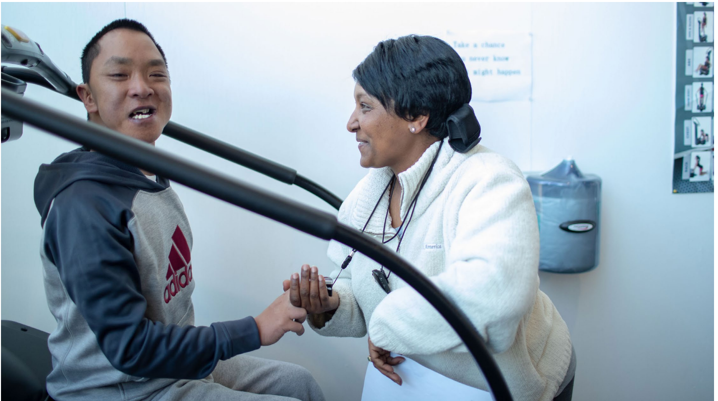
San Jose City College