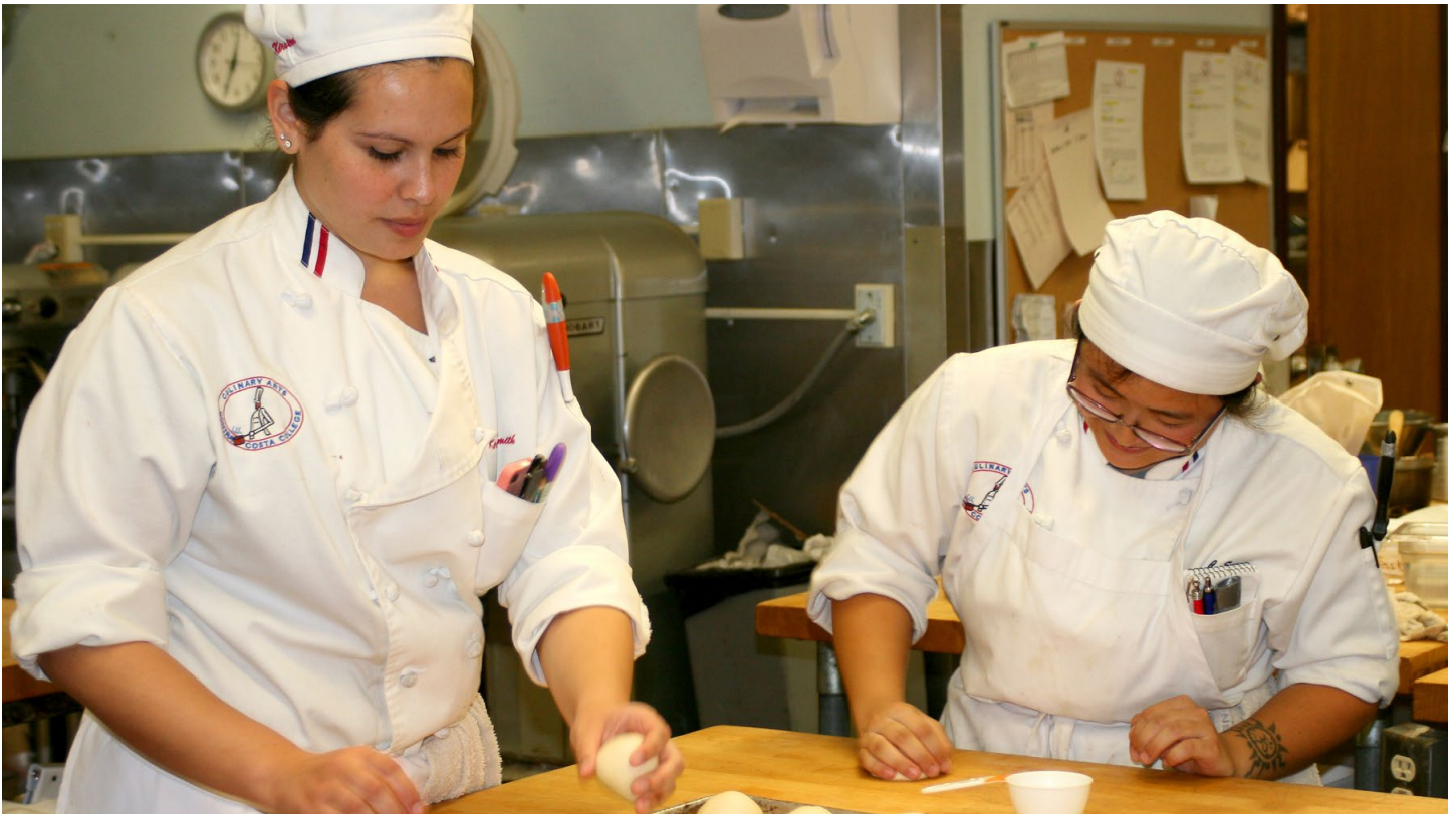
San Jose City College