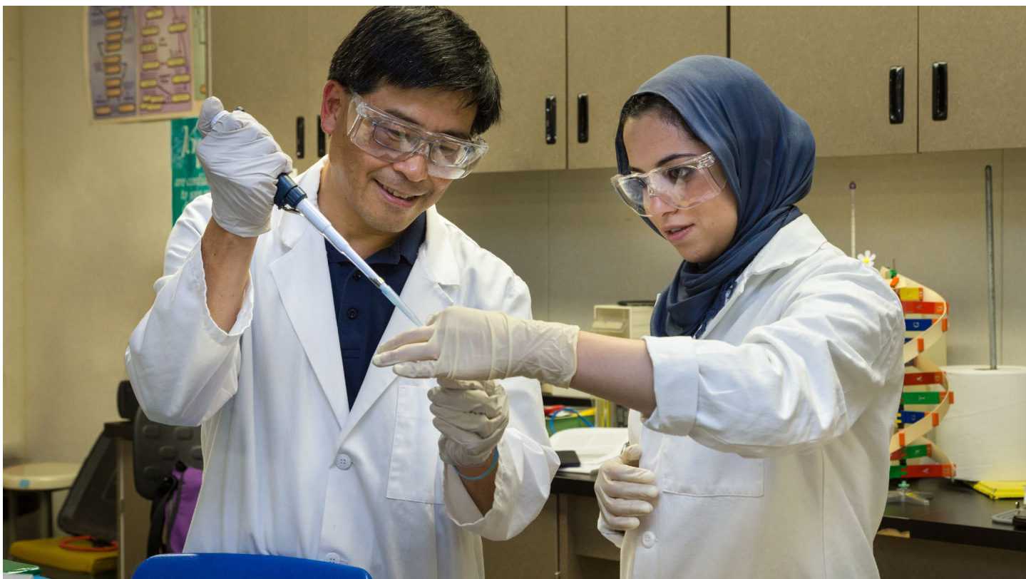
American River College